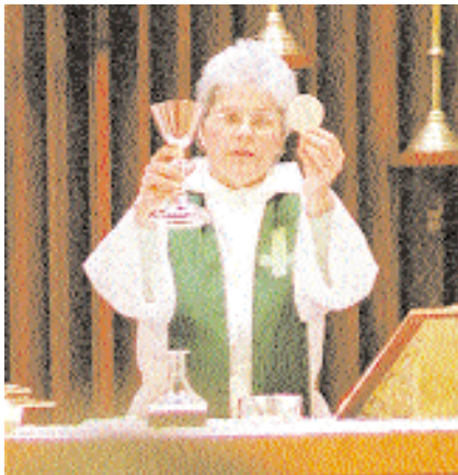
Women continue to be ordained as ministers and priests by many denominations as the feminist movement maneuvers to reshape Christianity.

The reason is simply that ideas promoted by the Gnostics in the first and second centuries are very popular today! Gnosticism was a theology of liberation — pro-