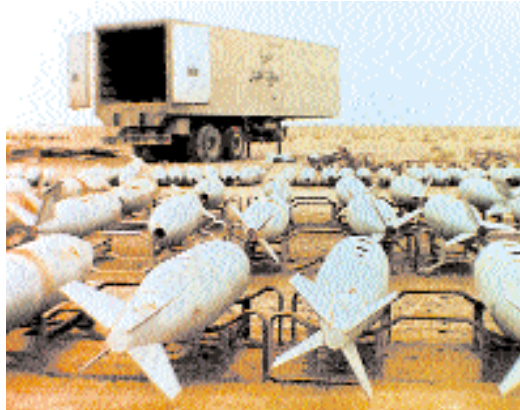
Aerial bombs filled with chemical warfare agents contribute to the spread of dangerous weapons worldwide.

How many people would be killed by just one such bomb? Dr. Alan F. Phillips describes it this way, “The estimates for a city of one million or two million struck by a single one-megaton bomb are that around one third of the inhabitants would be killed instantly or fatally injured, one third seriously injured, and the rest uninjured or only slightly injured. That number of injured, if they could be distributed throughout the