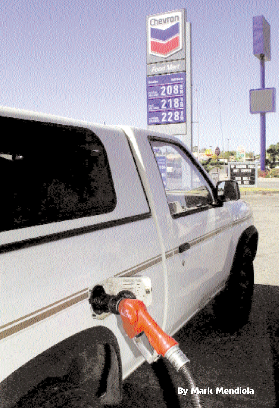
By Mark Mendiola

Soaring gasoline, diesel fuel and heating oil prices have jolted many Americans into realizing how beholden the U.S. economy remains to foreign oil-producing nations. Once again, world attention focuses on OPEC's pricing policies and its profound impact on international geopolitics. Have the lessons of the 1973 Arab oil embargo and the petroleum crises of the late '70s and early '80s been forgotten?