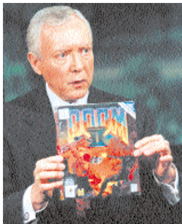
Senator Orrin Hatch, R-Utah, displays the video game “Doom” as an example of the violent pastimes influencing America’s youth.

The Creator of mankind sent along an instruction book for His creation—the Holy Bible. It offers guidance in instilling right values. The principles of loving discipline, guidance and teaching are illustrated throughout this book of books. Rather than participate in the tragically flawed child development experiments that marked the 20th century, parents can opt for a far better way. By coming to understand and apply the principles revealed by the Creator, our children can be a joy to us and to others. Not only that, they will be equipped to face life with solid values and healthy self-discipline, thereby enabling them to lead happy, productive lives of their own. TW