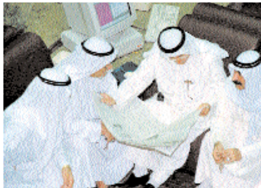
Kuwaiti investors, facing weak oil prices, follow news reports on the internal political crisis in their nation.

The Prophet Ezekiel gets even more explicit; showing we cannot buy the affection of our allies who will turn against us with our enemies. "Men make payment to all harlots, but you made your payments to all your lovers, and hired (or bribed) them to come to you from all around for your harlotry. You are the opposite of other women in your harlotry, because no one solicited you to be a harlot. In that you gave payment but no payment was given you, there-