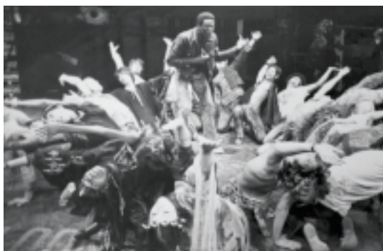
The free speech emphasis of the Sixties resulted in vulgar and profane productions like “Hair” advocating the “tune in, turn on, drop out” mentality of the acid-rock generation.

Looking at specific issues, the undeniably negative results of this “liberating” revolution are even more shocking! By removing the stigma from divorce, America now claims the highest divorce rate in the world. The family, long considered the basic building block of strong, stable societies, is literally under assault in the Western world. The liberation of women from marital responsibilities and sex roles outlined in the Bible, has resulted in more women in therapy and on tranquilizers than ever before. Combined with easy divorce, the “women’s lib” movement has spawned a huge jump in single parent families and the feminization of poverty. Homosexuality is touted as a normal,