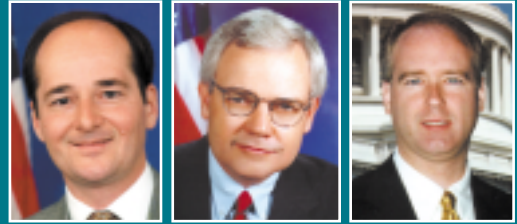
Among the outspoken congressional supporters of posting the Ten Commandments in schools and public places are (from left): Charles Canady, R-Fla., Robert Clement, D-Tenn. and Robert Aderholt, R-Ala.

ments are felonies under the laws of the United States,” Isakson said. “Posting them has the effect that the individual who reads them may