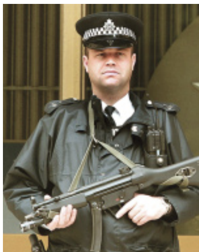
Britons who once took pride in their largely unarmed police force are now calling for the routine arming of law enforcement officers.

After condoning sexual freedom, abortion, easy divorce, and removing the stigma of unmarried motherhood, Britain ranks among the world’s leaders in divorce, teen pregnancy and births out of wedlock. Political leaders and their staff live openly with their