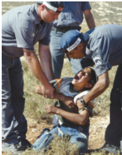
A Jewish settler, resisting the demolition of a West Bank settlement near Ramallah, is forcibly taken into custody by Israeli police.

Even today, there are plans afoot in continental Europe to create a counterweight against the Anglo-Saxon powers. The Stratfor Report recently described the beginnings of a fundamental shift in strategic alliances: "Russia and Europe appear to be joining forces to counter the