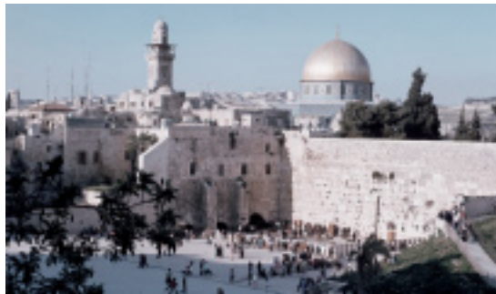
First-century Christians looked to Jerusalem for leadership.

of the early “Catholic Fathers” during the Dark Ages—became very different because it completely forsook the foundational