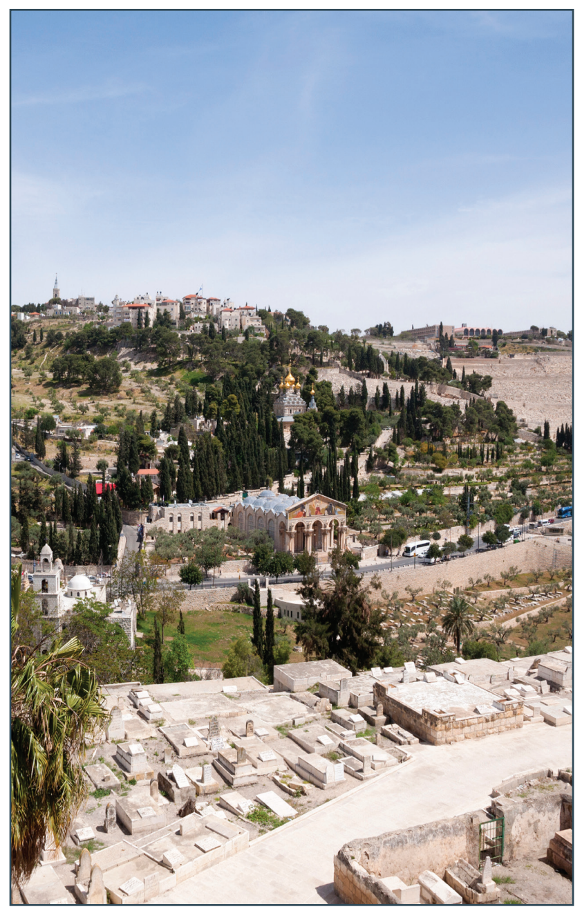
View across Kidron Valley toward Mount of Olives