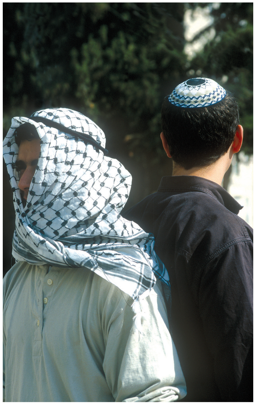
The rivalry between Abraham's "cousins" will continue to the end of this age.