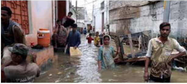
Flooding in Karachi, Pakistan, on August 22, 2022