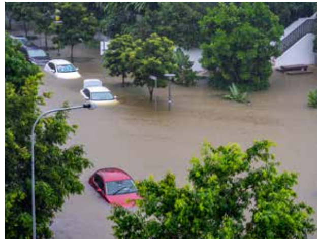
Flooding in Brisbane, Australia, on February 27, 2022

When you beget children and grandchildren and have grown old in the land, and act corruptly and make a carved image in the form of anything, and do evil in the sight of the LORD your God to provoke Him to anger, I call heaven and earth to witness against you this day, that you will soon utterly perish from the land which you cross over the Jordan to possess; you will not prolong your days in it, but will be utterly destroyed. And