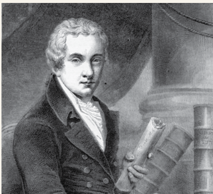
Engraving of William Wilberforce, from 1867

Wilberforce’s personal reflections on God’s word and his responsibilities in life produced not just an outward change in his conduct, but a profound change in his character and outlook. He strove to abide by what he