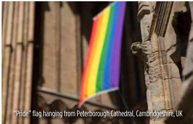
“Pride” flag hanging from Peterborough Cathedral, Cambridgeshire, UK

Late last year, in a Sunday service at St. John the Baptist's in Felixstowe, the Eucharist service of the Church of England