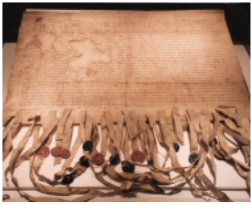
The declaration of Arbroath, signed in 1320AD, states that the Scots came from Scythia.

blessings of the birthright promises would be focused on the descendants of Joseph's two sons, Ephraim and Manasseh. Manasseh would become a great nation, and Ephraim would become a company [multitude or commonwealth] of nations (Genesis 35:10-12; 48:19). These very specific promises have found fulfillment in the United States of America and the nations of the Britishdescended peoples (Britain, Canada, Australia, New Zealand and South Africa). America has