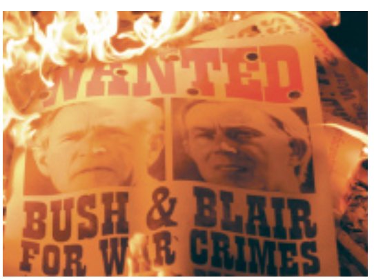
Great Britain, for decades a staunch ally of the United States, has been torn by division over U.S. policy in Iraq, and by conflicting visions of its relationship with Europe.

This ill will, distrust and vilification of America, bubbling up in so many places, is generating a growing isolation of this country from the community of nations. At the United Nations, countries upset by what they consider