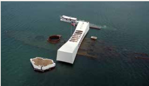
USS Arizona Memorial in Pearl Harbor

It was with this personal perspective that I made the trip to Pearl Harbor. The boat ride to the monument, which is constructed over the sunken battle ship, brought me to a stark reminder of the consequences of war. The monument itself is a beautiful white structure which contains the names of all 1,177 sailors, Marines and officers that lost their lives