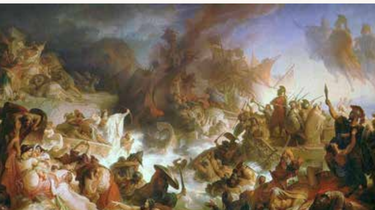
Wilhelm von Kaulback's depiction of the Battle of Salamis (Die Seeschlacht bei Salamis, 1868)