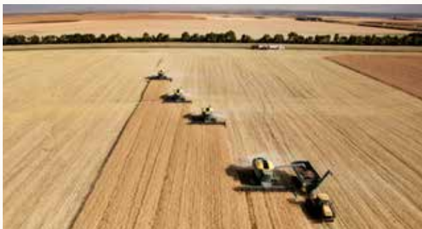
Harvesting in Canada

Many prophecies in the Bible paint a vivid picture of this idyllic time. Peter refers to this time as "the times of restoration of all things" (Acts 3:21). Isaiah describes the deserts blossoming with life (Isaiah 35:1-2) and a time of great healing (Isaiah 35:5-6). Zechariah reveals the sense of peace and safety that will be enjoyed by