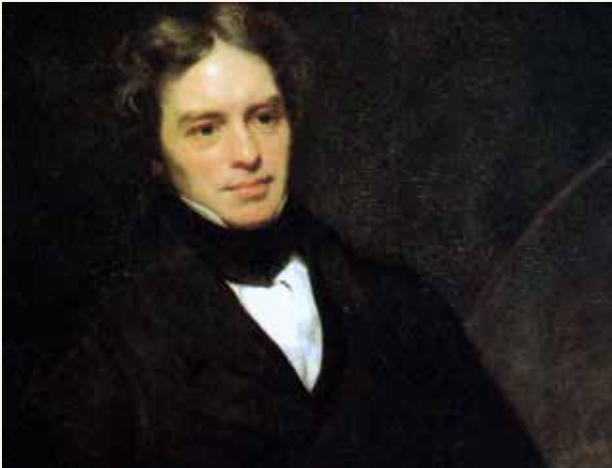
Michael Faraday (1791-1867)