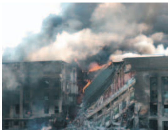
Terrorism struck at the heart of U.S. military power on September 11, 2001, when a hijacked commercial airliner was flown into the Pentagon in Washington, DC.

Various perversions, including homosexuality, are labeled an abomination to Almighty God (cf. Leviticus 18). Israel of old was told that the promised land had "vomited out" the nations that were there before them because of such perversions (v. 28) and that if they did likewise, the same results would follow. In 21st century America, it is considered acceptable for a judge who refuses to remove the Ten Commandments from his courtroom to be tossed from the bench, as was Chief Justice Roy Moore of the Alabama Supreme Court. Yet, on the other hand, the media labels as "progressive" and "courageous"