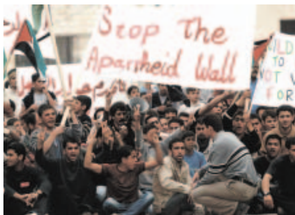
Palestinians gather to protest Israeli security measures, charging that they are being deprived of their rights, their homes and their livelihoods.

Does Israel today "dwell safely" in "unwalled villages"—that is, without military protection?