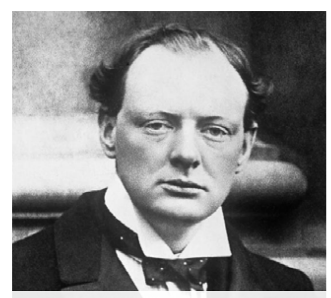
A young Churhill as Member of Parliament for Oldham in 1904

When Germany invaded Poland in September 1939, Britain declared war on Germany. Prime Minister Neville Chamberlain, who not long before had proclaimed "peace in our time" and championed his ac-