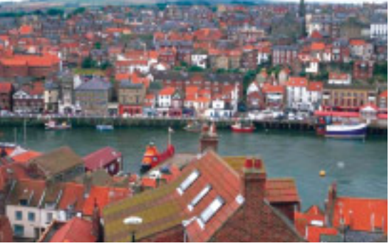
Whitby, an ancient fishing port at the mouth of the River Esk, hosted the English synod that in 664AD renounced Apostolic Christianity in favor of Roman doctrine.

461... however, we have to admit that there were