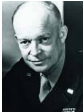
U.S. Army General Dwight D. Eisenhower saw, firsthand, God’s miraculous intervention in the weather.

Some of the most dramatic examples of divine intervention occurred during World War II—a war that Winston Churchill felt threatened the future of “Christian civilization.” During two short weeks in May 1940, the Germans launched a blitzkrieg offensive that broke through French lines, defeated the Belgians and pinned a reeling British army against the ocean at Dunkirk. Several British generals said that “only a miracle” could save their beleaguered forces. Yet with certain victory within their grasp, Hitler suddenly halted German tanks just 20 miles from Dunkirk, fearing that they were dangerously exposed and had outrun their supply lines. During this lull, a severe thunderstorm grounded German planes, allowing Allied troops to move toward Dunkirk and set up a defense perimeter. Following a National Day of Prayer led by King George VI for the hopelessly trapped army, the British began an evacuation effort that lasted for nine days, during which the normally rough and unpredictable English