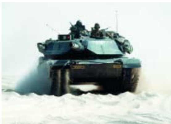
The American military, formerly accustomed to easy victories, is facing tremendous obstacles in its effort to “democratize” Iraq.

“seven times.” Numbers 14:34 and Ezekiel 4:6 establish the principle that a day is equal to a year in fulfillment of Bible prophecy. Beginning from 721BC, when Israel first went into captivity, this “seven times” extension of its