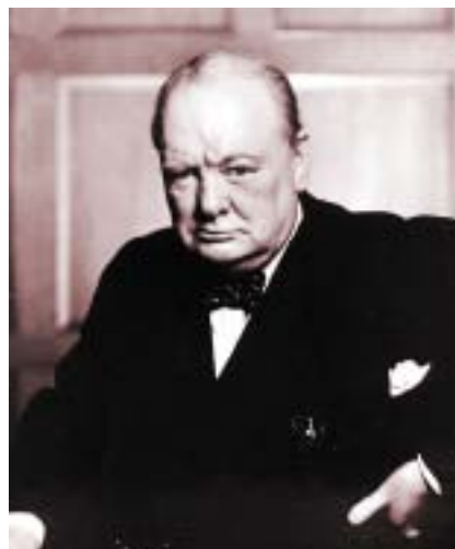
“Some great purpose and design is being worked out here below, of which we have the honor to be faithful servants.”—British Prime Minister Winston Churchill.

sea.” Throughout his speeches and in his writings, Sir Winston Churchill commented upon the remarkable and meaningful relationship between the American and British-descended peoples. One of these prescient statements was contained in Churchill’s address to the U.S. Congress on December 26, 1941: “If you will allow me to use other language I will say that he must indeed have a blind soul who cannot see that some great purpose and design is being worked out here below, of which we have the honor to be the faithful servants. It is not given to us to peer into the mysteries of the future. Still I avow my hope and faith, sure and inviolate, that in the days to come the British and American people will for their own safety and for the good of all